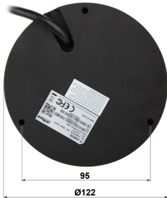
See how to initialize DAHUA cameras: