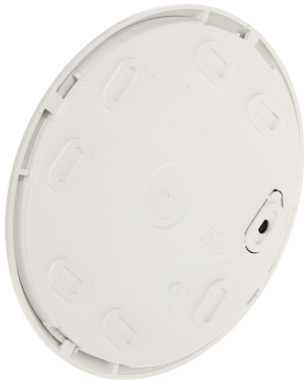
Description of particular elements of the device: