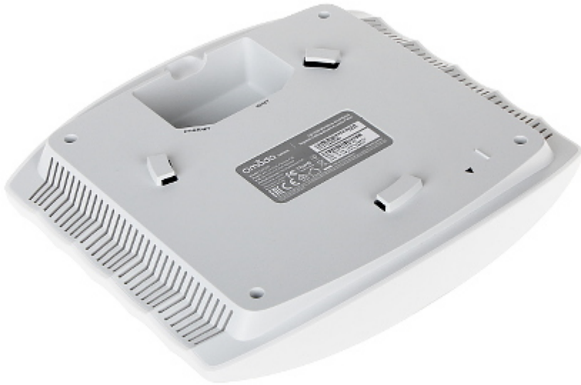
Ethernet socket view: