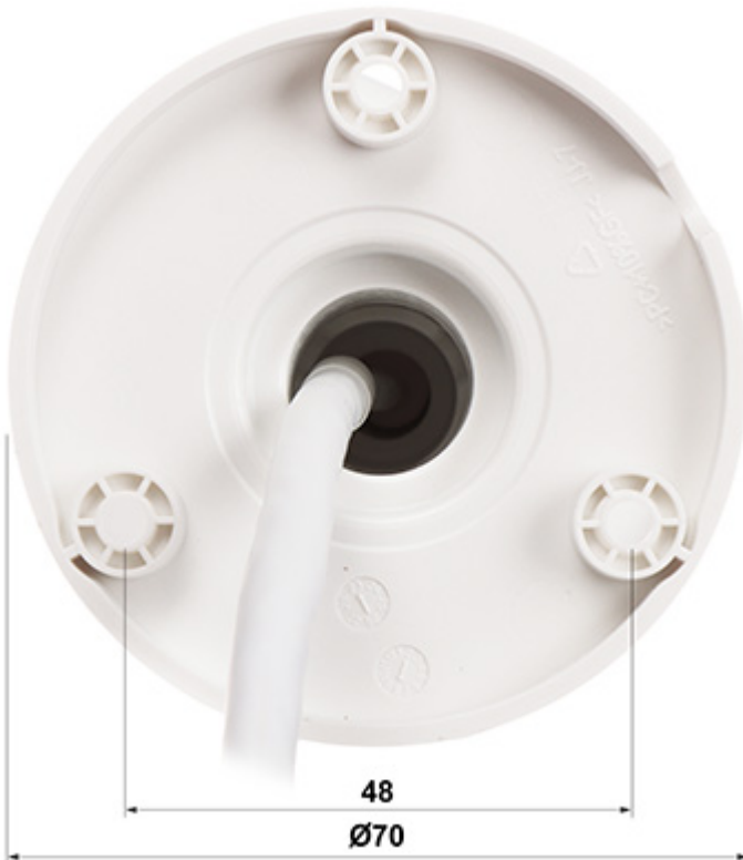
Camera mounting dimensions:

DELTA-OPTI Monika Matysiak; https://www.delta.poznan.pl POL; 60-713 Poznań; Graniczna 10 e-mail: delta-opti@delta.poznan.pl ; tel: +(48) 61 864 69 60