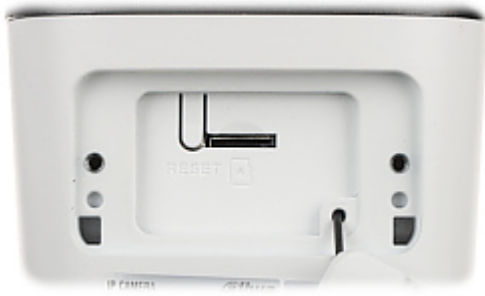
Camera mounting side view: