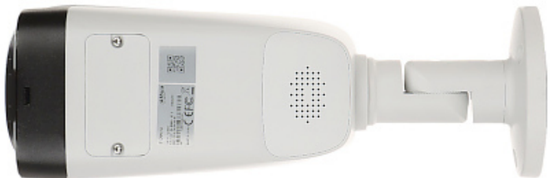
Memory card slot and "Reset" button: