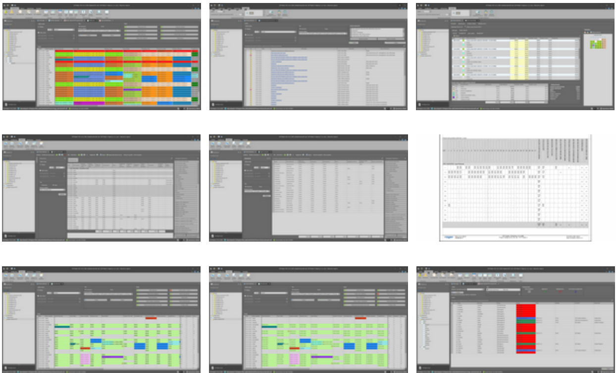
Example screenshots EN: