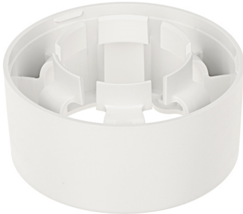
Wall mounting side view: