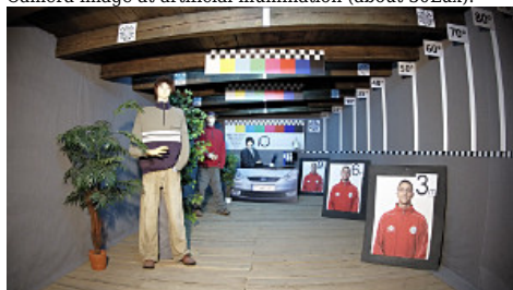
Camera image at artificial illumination (about 30Lux):