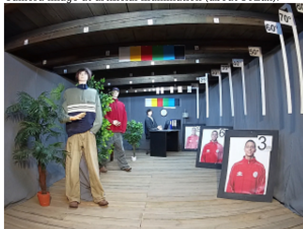
Camera image at artificial illumination (about 30Lux):