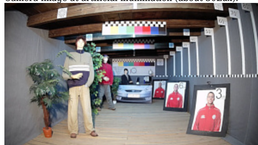
Camera image at artificial illumination (about 30Lux):

DELTA-OPTI Monika Matysiak; https://www.delta.poznan.pl POL; 60-713 Poznań; Graniczna 10 e-mail: delta-opti@delta.poznan.pl ; tel: +(48) 61 864 69 60