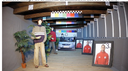
Camera image at artificial illumination (about 30Lux):