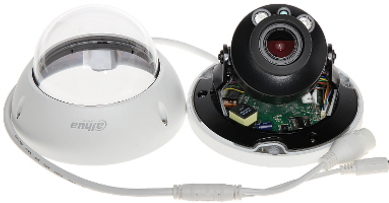
Memory card slot: