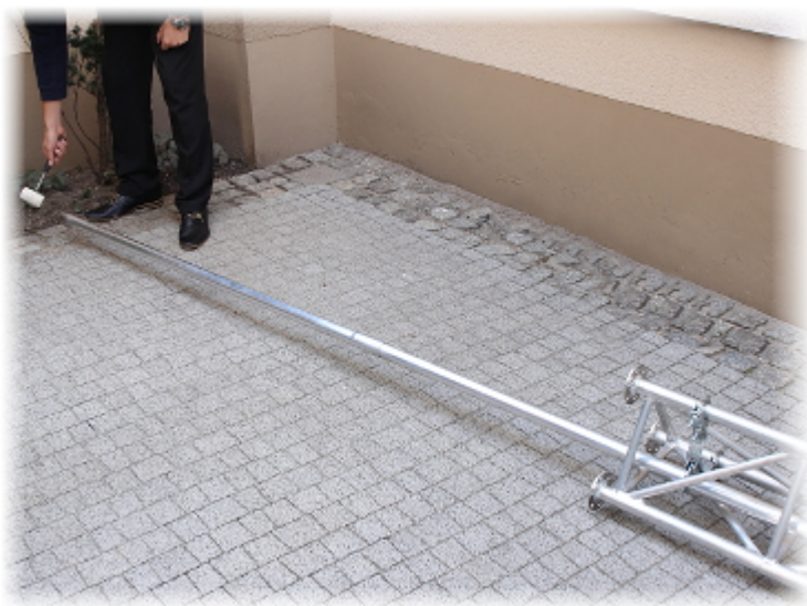
The combination of a truss mast with a pipe mast: