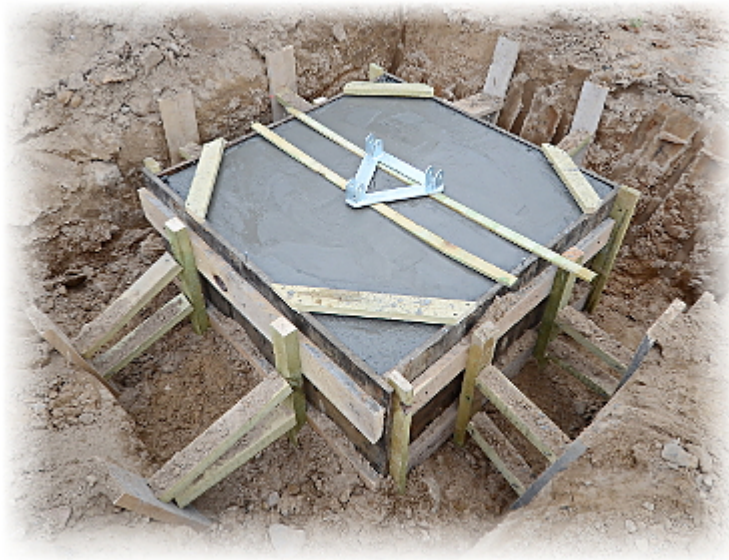
Ready foundation with the set mast: